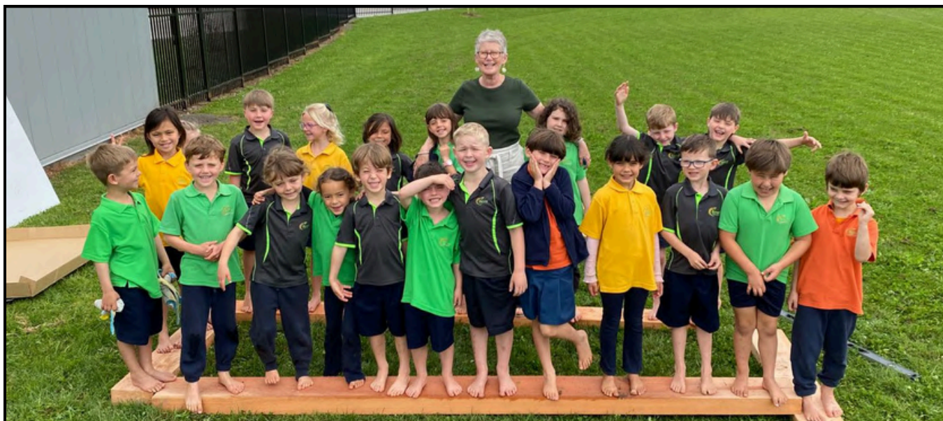
The Junior Garden Project Takes Root!!!!!!

Welcome to Harvest Newsletter Issue 24! Keep an eye out for celebrations, the latest on the Aquabots Teams, achievements in sport, growing our very own veggies on the school grounds and heaps more.. As a staff, we are praying for each of you - stay connected, and let's embrace the adventures lying ahead this term. With less than three weeks of school remaining, we look forward to an exciting end to 2025.